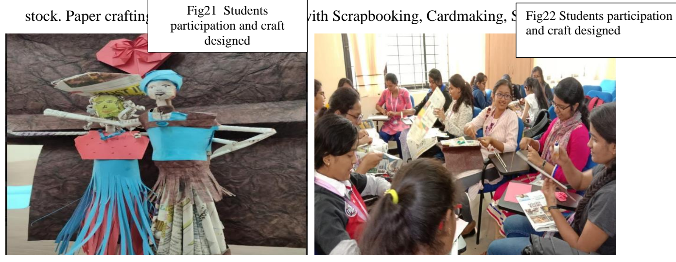
Students participation and craft designed

<u>Industry – Institute Interaction:</u> Industrial Visit: