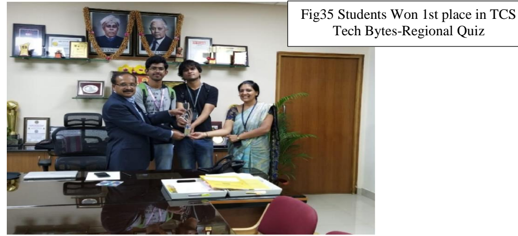
Students Won 1st place in TCS Tech Bytes-Regional Quiz