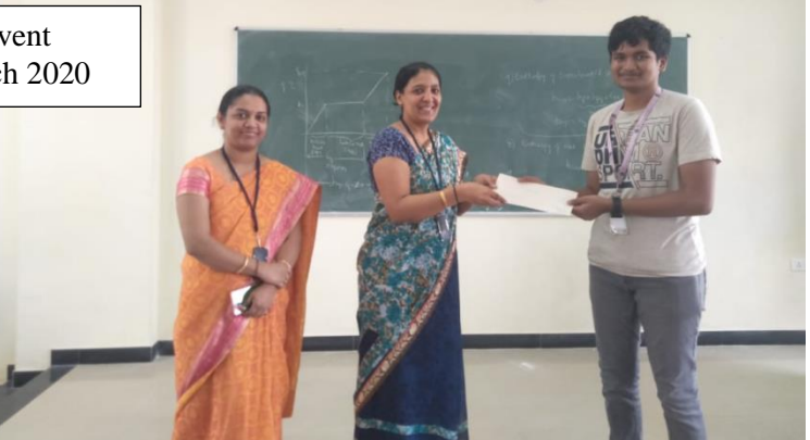
Codethon event conducted on 6th march 2020.

Fig34 Codethon event conducted on 6<sup>th</sup> march 2020