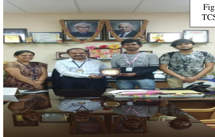
Fig36 Students Won 2<sup>nd</sup> place in TCS Tech Bytes-State level Quiz