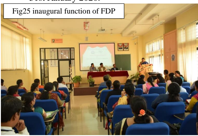
Inaugural function of FDP

• Department has conducted a FDP on "Data Analytics - A Practical Approach "from 27th to 31st January 2020.