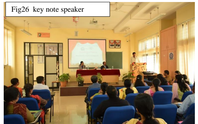
key note speaker